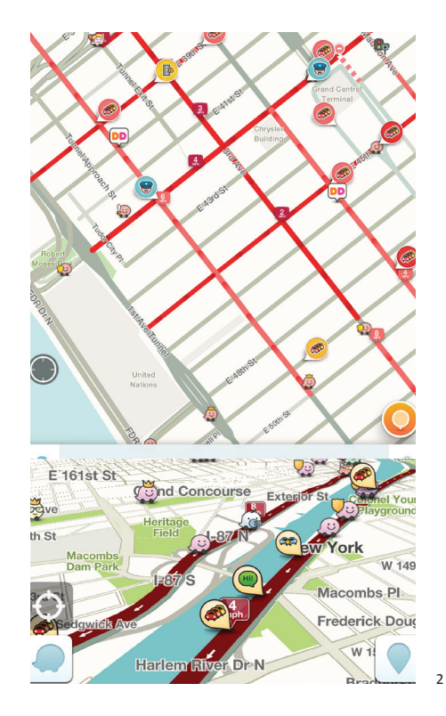
Figure 2: Crowdsourced apps like Waze allow for real-time adaptive urban navigation

Filled with individually addressable object-agents, the environment acquires new functionalities. It shifts from a simple backdrop or a context to an emancipated and equal player that interacts with other actors. Similarly, media—social ecology in Guattari's model—permeate through all scales of the landscape, corresponding closely to the vision outlined by Marshall McLuhan in The Medium is the Massage: An Inventory of Effects (1967). McLuhan's vision frames the symbiosis between culture and nature in acute and contemporary-relevant ways. Media become an intangible urban fabric connecting people and places as well as defining the patterns that form spatial identities. Electronic media components fundamentally redefine the very fabric of spatial habitation. The space-time continuity is being relaxed in lieu of cinematographic (narrative) spatial and chronological discontinuities. It corresponds to Lynch's observations regarding urban mental maps: "Most often our perception of the city is not sustained, but rather partial, fragmentary, mixed with other concerns. Nearly every sense is in operation, and the image is the composite of them all" (Lynch, 1960, p. 2). Fragmentation