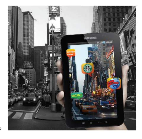
Figure 3: Mobile augmented reality (AR) is just one of the platforms that provide customizable view of the city.

For example, for some New York City (NYC) is associated with September 11 events or with nineteenth-century immigration waves as repr esented by the Statue of Liberty. For others, it is associated with the iconic Central Park, with Woody Allen's movies, or with the Sex and the