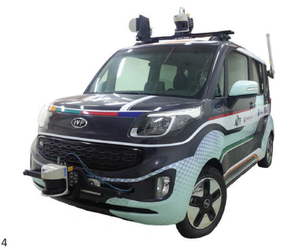
Figure 4: Autonomous vehicle with multiple sensing systems

Autonomous objects also manifest alternative modes of perception (fig.5). Their sensory readings perceive broader spectral ranges with different tolerances and data processing speeds. Sensors are positioned differently, often distributed and integrated with the object's materiality. What for humans is considered a continuous movement may for a machine be a series of distinct moments with separate time registrations. Their autonomous behavior will reflect differences in sensory and actuation abilities, leading to a different concept of spatial privacy and proximity—not unlike with various human cultures.