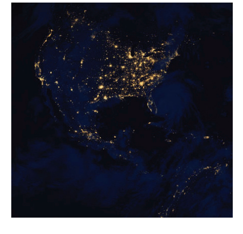
Figure 1: Settlement distribution, night view, (NASA)

Similarly, form may be a manifestation of temporal conditions driven by users and their momentary needs. It is no longer an inert landscape made of stone but rather a hybrid cyber-physical construct that materializes the dynamic connections of its agents. As such, static classifications and theories of urban form are no longer sufficient and need to be extended to include these new electronic and media-driven dimensions. Defining the image of the city as a result of five physical elements (Lynch, 1960) undercounts the virtual and emotional components and drives that are present in the environment. Operating within objectified and generalized categories cannot be extended into a quantum scale of urban habitation. Similarly, the assumption that these categories are commonly shared and agreed upon does not consider individual and subjective experiences. For example, all city dwellers know objects and places within their city that are considered culturally significant, but these places may have no bearing on their individual experience of the city. Quite often inhabitants choose to spend time in spaces that are not commonly shared so as to avoid traffic, to manifest individuality, or to relive personal and meaningful moments that happened in a certain location.